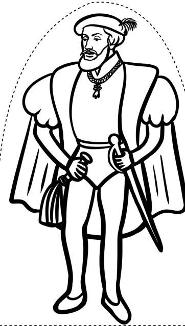
Emperor Charles V