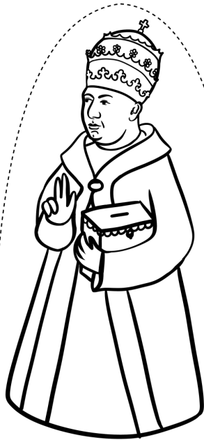
Pope Leo X