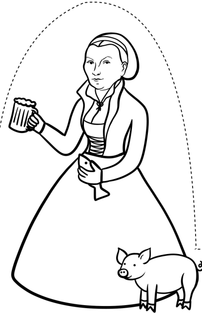
Katharina von Bora