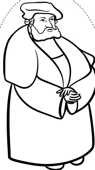
Frederick the Wise